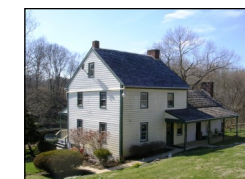
Exhibit Farm House