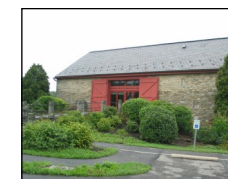
Environmental Education Center

Minimum of 4 hours $375 Each additional hour $75