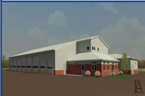
Above: Proposed maintenance facility

The total of all bids is $2,408,059.00. The Township has been saving funds for this project since 2002. The project will be paid for with the township's general fund as well as a 1.7 million dollar loan from Susquehanna Bank. This is a 20 year loan; however, the desire is to pay the loan off in a shorter time period. Township residents will not see a tax increase to pay for this building. The Supervisors are in agreement that taxes will not be raised to pay for a building. The project is scheduled to begin in late October 2010 with completion in May, 2011. We have also applied for two grants through the Pennsylvania Department of Community and Economic Development. If awarded, the grants will help offset the cost of the windmills and the wood-gasification boiler.