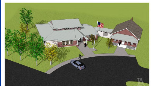
Providence Township Municipal Facility Municipal Office Building - Exterior Rendering 1